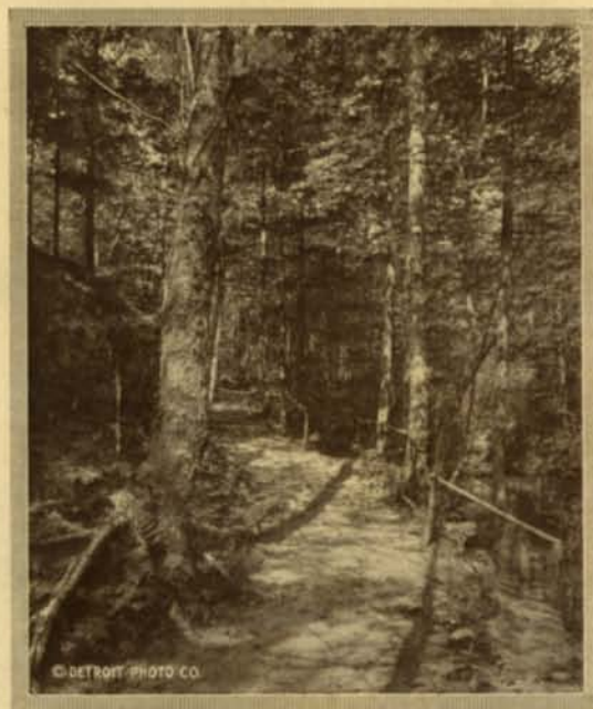
NEW PROFILE HOUSE White Mountains New Hampshire