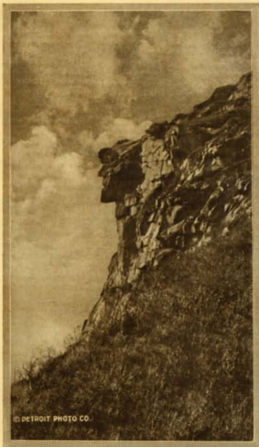
OLD MAN of the MOUNTAIN